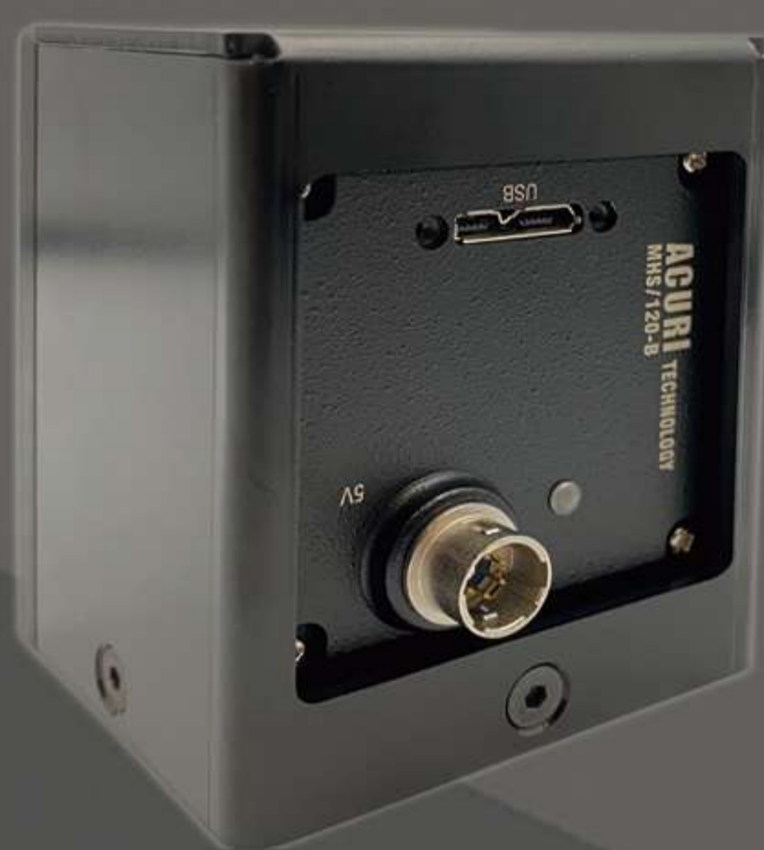
Ultra High Sensitivity Digital X-ray Camera 1580 x 1080 pixel (1.7M)

X-ray camera designed and manufactured by ACURI. The CMOS sensor of camera is from Sony, it's ultra high sensitivity sensor. The camera feature is adjustable exposure time and gain by software controlled. Can provided high quality x-ray image for thick PCB.